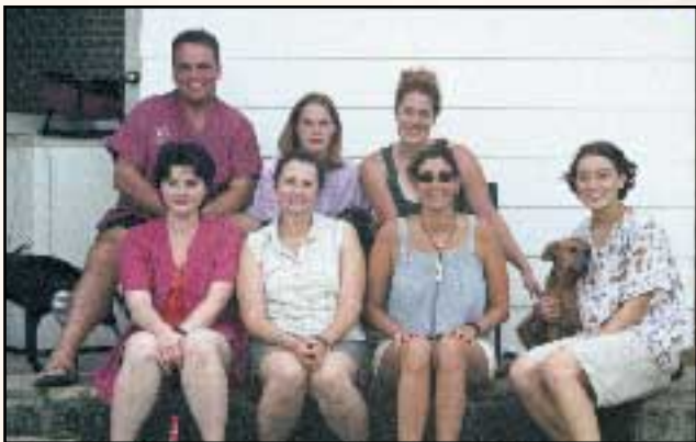
The all-volunteer EHF staff, November, 2000.

nection. You know that in your arms they feel safe and loved and taken care of. They are grateful for the attention that they haven't received all of their lives."